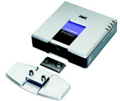
Figure 3-5: Attaching the Phone Adapter's Base

If you need to change any of the Phone Adapter's network settings, proceed to "Chapter 4: Using the Phone Adapter's Interactive Voice Response Menu."