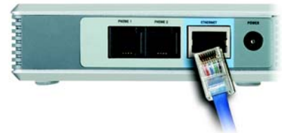
Figure 3-3: Connect the Ethernet Network Cable