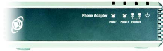
Figure 2-2: Front Panel

The Phone Adapter's LEDs are located on the front panel.