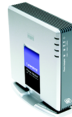
Figure 3-6: Phone Adapter Standing on Base