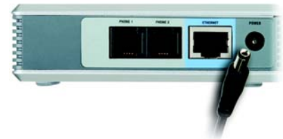
Figure 3-4: Connect the Power