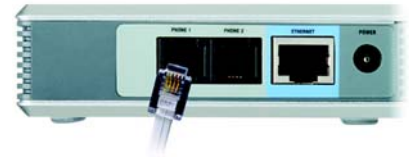
Figure 3-2: Connect the Telephone Cable

Proceed to the next section, "Placement Options," if you want to attach the Phone Adapter's base.