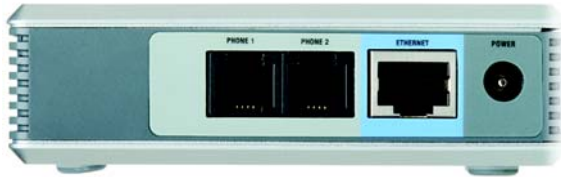
Figure 2-1: Back Panel

The Phone Adapter's ports are located on the back panel.